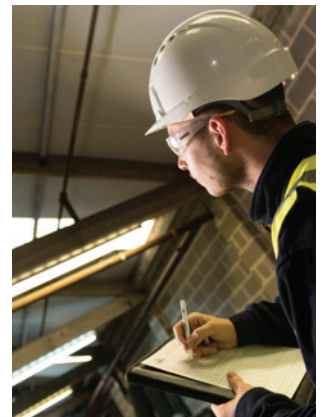
DS Plug and Play 06.20